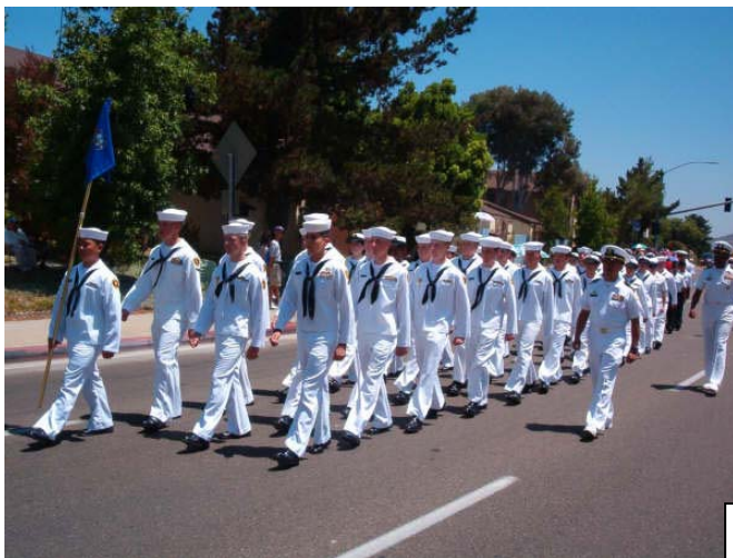
Above is a picture of the Gunfighter Squadron and Training Ship TOPGUN taken at the Mira Mesa 4 th of July Parade.