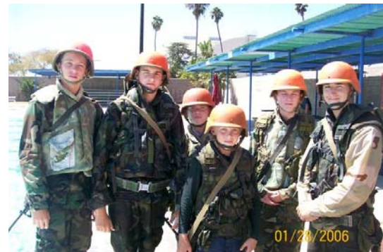
Above: Sea Cadets @ MCAS Combat Water Survival Training

Recruiting for the Sea Cadets is a high priority - taking action at the local level in the schools and community.