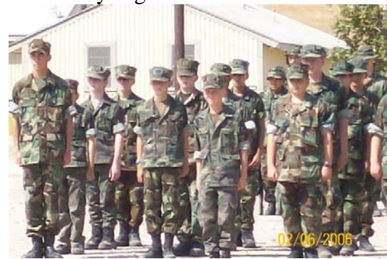
Above: Sea Cadets @ Camp Roberts

The Tri-City Council NLUS sponsors the Gunfighter Squadron & Training Ship TOPGUN, located at MCAS Miramar, San Diego, California. For more information about Gunfighter Squadron & Training Ship TOPGUN - MCAS Miramar please visit their website at www.seacadets.org/gunfighter or call (858) 373-8785.