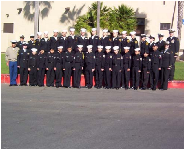
Above is a picture of the most recent Gunfighter Squadron Unit taken in January 2005