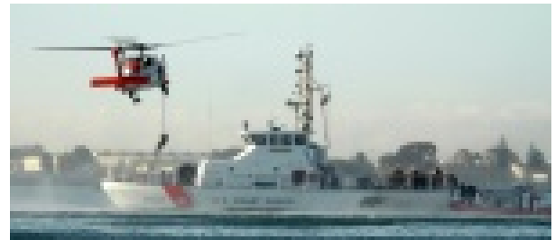
Above and below pictures of Coast Guard Haddock Cutter and Rescue Chopper. Our Council sponsors the Haddock Crew!

Activities: Veteran's Day parade, Cadets will march in the Coronado Christmas parade. USMC Combat Water Survival Swim Qualifications: All Cadets are at least Class 4, some are Class 3, and 5 are Class 2!! MCAS Simulator weapons range and F-18 simulators were the recent activities for the unit. Cadets will be going aboard a Destroyer in Dec and Jan for damage control and firefighting exercises.