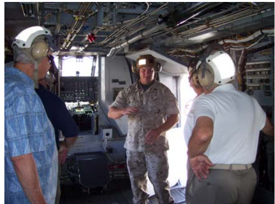
Above picture: Inside a HMH-361 Crew Member and Navy League Members.