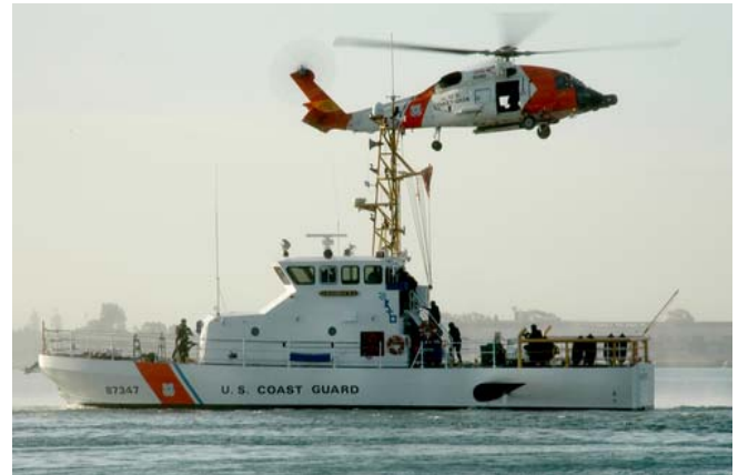
Top Right: USCG Haddock and Rescue Chopper

The Tri-City Council NLUS sponsors the Gunfighter Squadron & Training Ship TOPGUN, located at MCAS Miramar, San Diego, California. For more information about Gunfighter Squadron & Training Ship TOPGUN - MCAS Miramar please visit their website at www.seacadets.org/gunfighter or call (858) 373-8785.