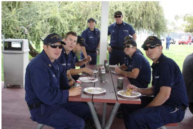
Top Picture: USS New Orleans

Thank you all who joined us on our USS New Orleans Tour on Saturday, January 26, 2008. 40 people and our Sea Cadets got a VIP Tour of the ship. Thank you all who attended! Our special package included Round Trip Bus, Tour, and Lunch aboard the ship and a ship's hat! It was a treat for all who got to experience it.